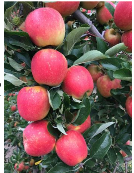
The high sugar, high acid, and high aroma make the overall fruit quality of 'Firecracker' unforgettable, and makes an excellent varietal hard cider.

NY73 is a very large conic apple. The attractive pink blush (over a green/yellow background color) is eye-catching, NY73 has excellent crisp texture and juiciness making it very well suited to retail on-farm sales and you-pick operations. The tree has good vigor and growth habit, making it easy to manage in the orchard. Fruits are sun-sensitive, so blush coverage will range from 20 to 40%.