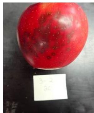
Figure 5 (left): Dark brown round blotches (DBRB) associated with lenticels, cv 'Snapdragon'.