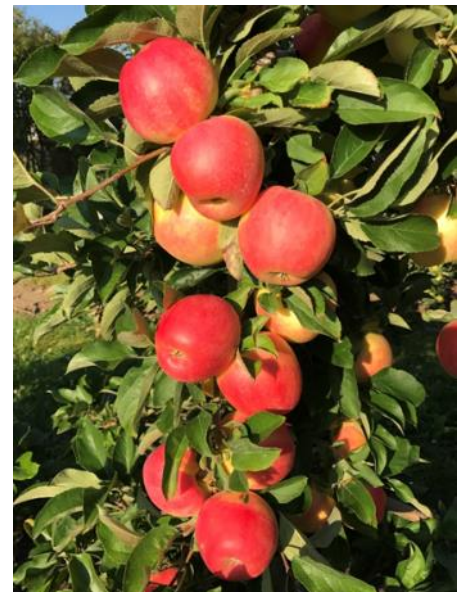
'Pink Luster' has excellent crisp texture and juiciness making it very well suited to retail on-farm sales and you-pick operations.