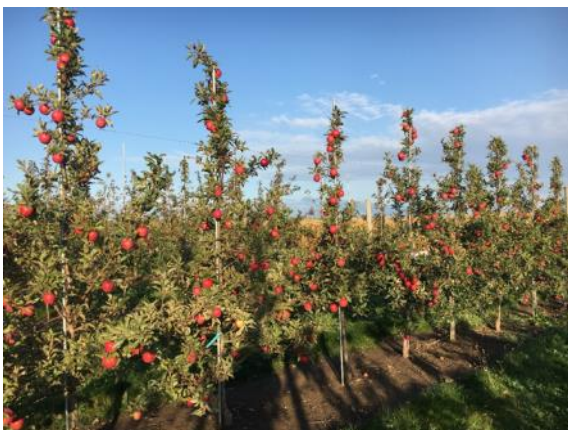
A block of WildTwist in the Champlain Valley. This variety is picked about the first week of November in Clinton County.