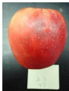
Figure 9: Incidence by block of pebbly skin in select Hudson Valley 'Snapdragon' orchards post-storage in 2018.