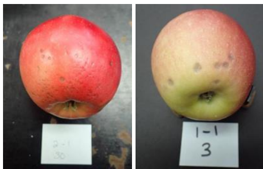
Figure 1 (left): Smaller, angular-shaped bitter pit lesions with a more even distribution across the calyx-end of a 'Snapdragon' apple.

Insects, disease, and spray chemical phytotoxicity all can result in spots on apples. Bitter pit lesions have certain characteristics that help distinguish this "calcium related disorder" from other maladies. Bitter pit lesions are most often found at the calyx (blossom-end) of the fruit and will have corky tissue