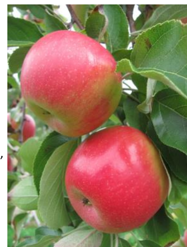
'Cordera' is an attractive, excellent quality, scab resistant apple.

The scion vigor is very low, less than 'Honeycrisp', and similar or lower vigor than NY1. This variety needs to be matched with a higher vigor rootstock to reach optimum potential, such as G.935, or